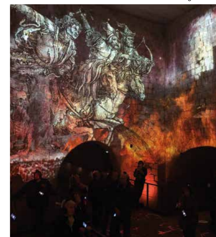
Tamschick Media+Space Festung Dresden