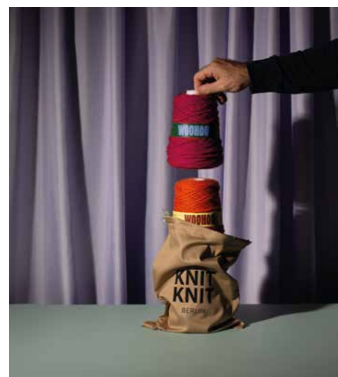
WOOHOO WOOL by KNIT KNIT Berlin & Lana Grossa

16.00 – 20.00 The MINIMONO Project, Brunnenstraße 158, 10115 Berlin Open house of the studio, workshop and garden. Playful discovery of the furniture.