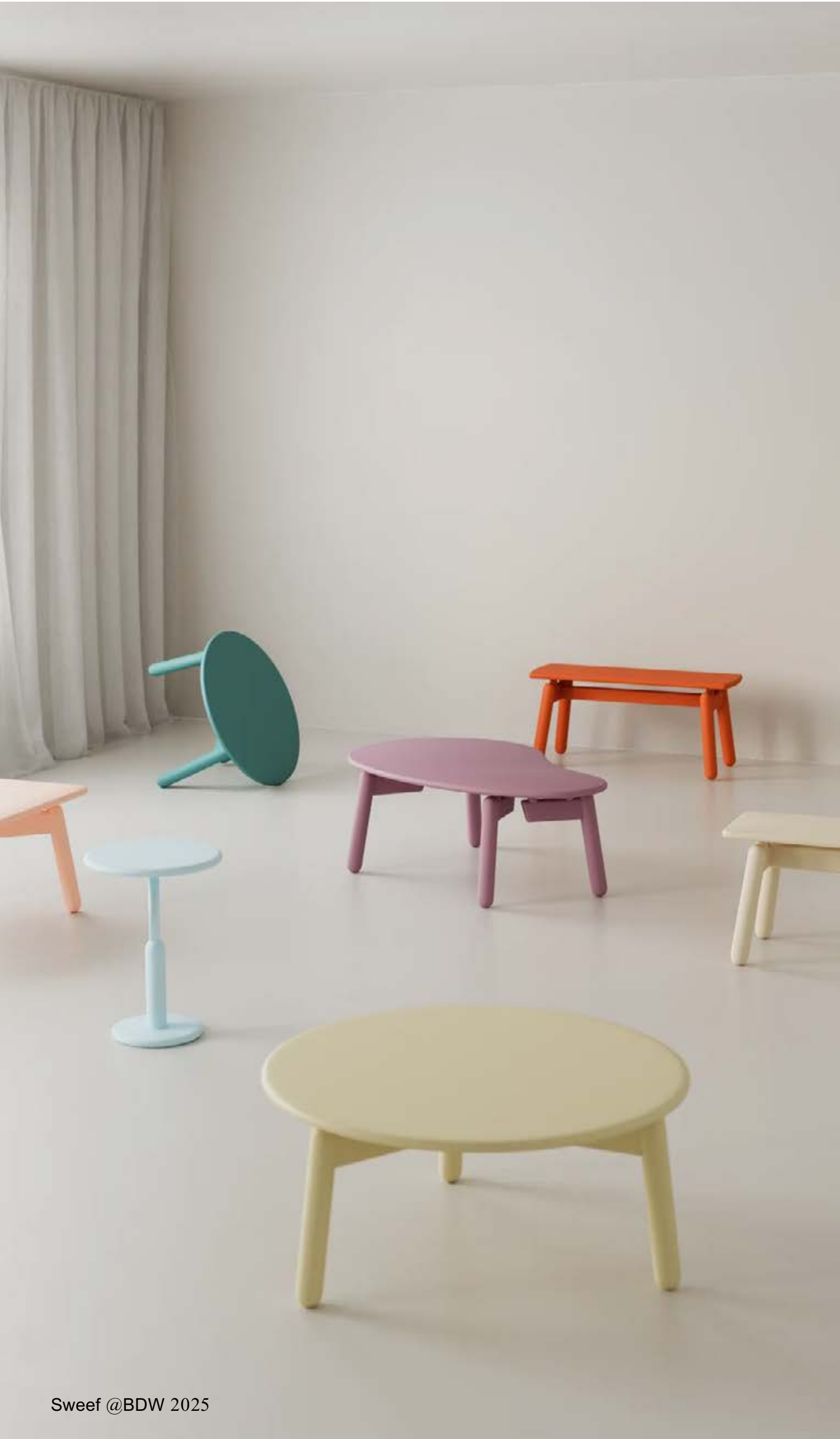
Sweef @BDW 2025