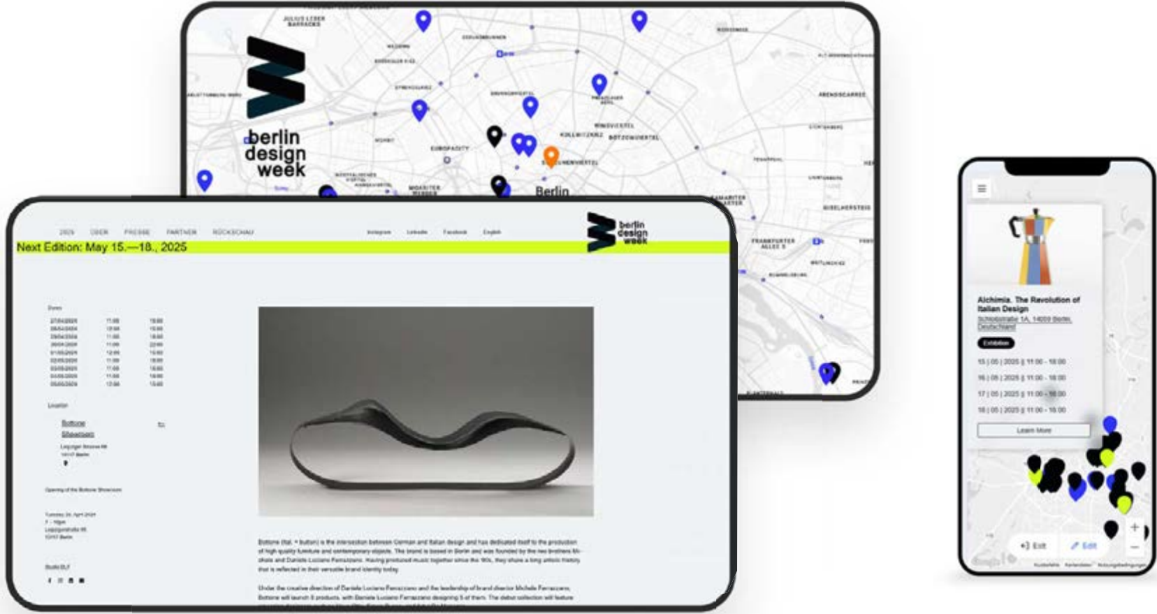
Map & Programm BDW online