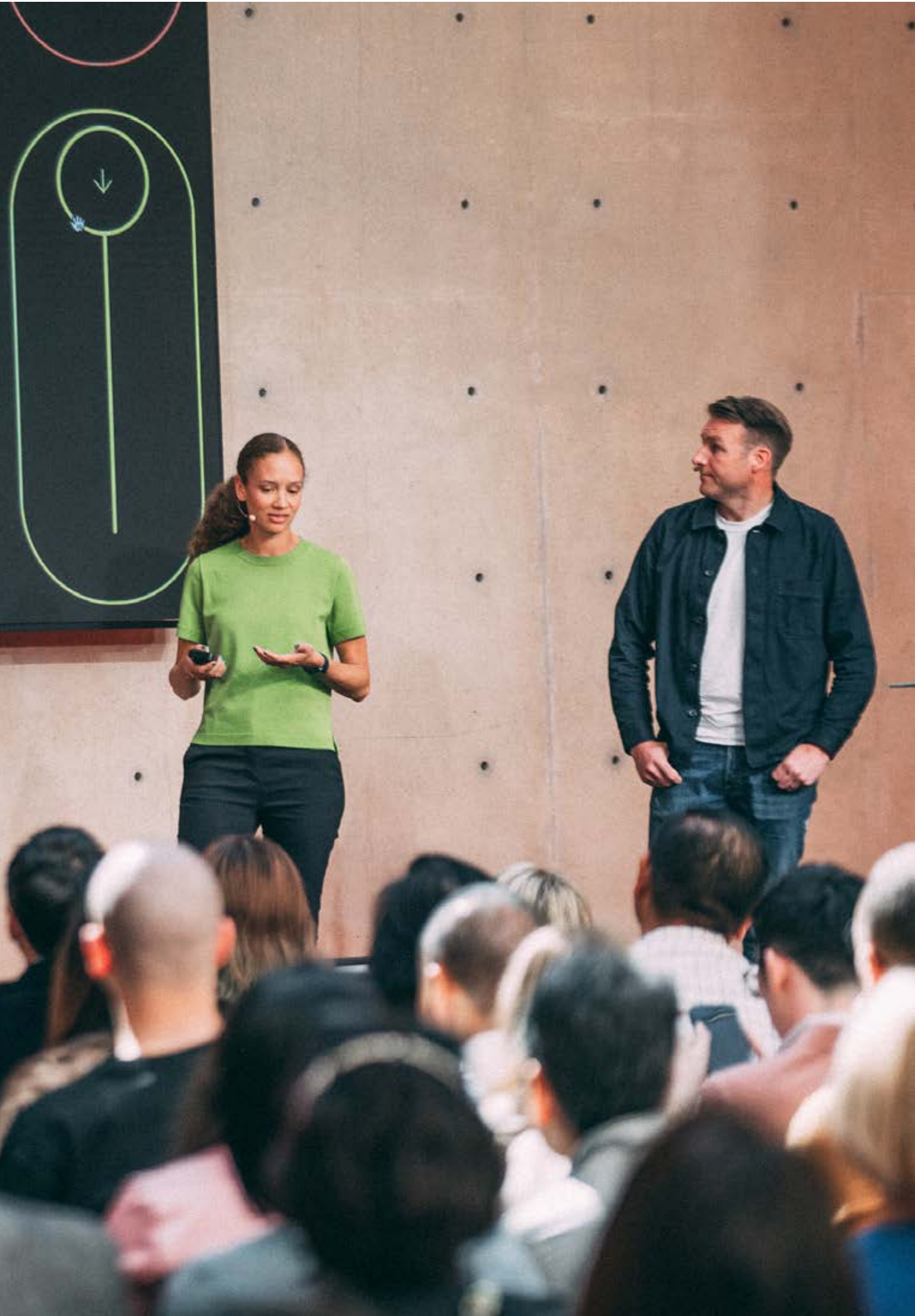
iF Ternd Conference

All fees apply per year // plus VAT, Topics tbd.